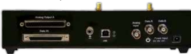
Demultiplexer Base Station Back View

Receiver output options include analog data to an ADC of your choice, digital data to NeuroWare™ or both modalities together.